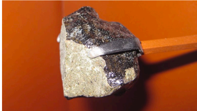
Nakhla (AMNH, D.C.)

Introduction. In 1911, a meteorite struck Egypt (purportedly killing a dog). The meteorite, named Nakhla, was recognized as a piece of Mars during the 1980s – one proof came from comparing the isotopic composition of gas trapped within meteorite glass to the isotopic composition of Mars air measured by the Viking landers.